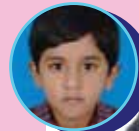
IRIN IV C