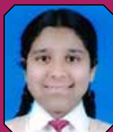
KALISTA - 7D