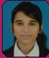
BATUL - 12K