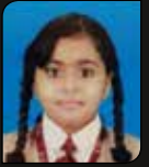
GAURI KRISHNA VENUGOPALAN -8B

it and pursued his dream of spreading KFC franchises & hiring KFC workers all across the country. At age 90, Sanders passed away from pneumonia. At that time, there were around 6,000 KFC locations in 48 countries. By 2013, there were an estimated 18,000 KFC locations in 118 countries. After years of failures and misfortunes, Sanders finally hit it big. Even today, Sanders remains central in KFC's branding and his face still appears in their logo. His goatee, white suit and western string tie continue to symbolize delicious country fried chicken all over the world.