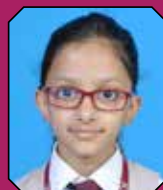
AAREFA - 6A