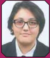
TIASHA - 12H