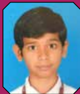
NISARG - 8D