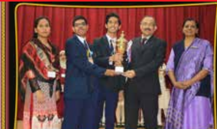
FIRST - 12J