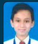
AFHAM - 8C