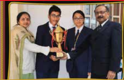
FIRST - 12C