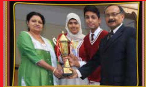
FIRST - 10C