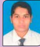
MALAIKA 12B - DEC. 11