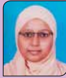
SAFFANA 10G - DEC. 11