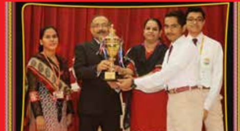
FIRST - 9E