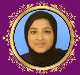
BASHAYER -12 J