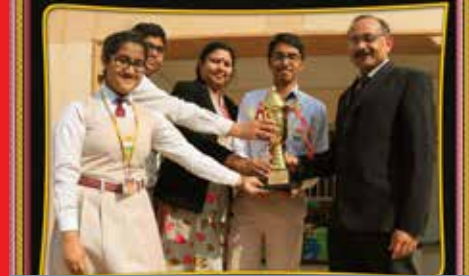
SECOND - 10B