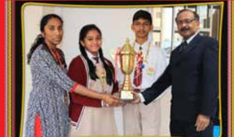
THIRD - 7E