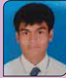
MISHAL 11M - DEC. 9