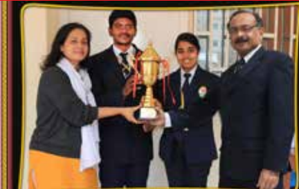
THIRD - 11D