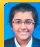
THASICA LAVITA 12G

We all are so concerned about our image That we are trapped in our own cage Judgements come at any age Filling ourselves into rage Being someone else to fit in Feels like trash you take in Comments crawling within Turning it into old stain Shaped into a standard mould Cracks coming out you try to hold Confuse and lost in cold Your way is always unfold Maybe someday its going to be alright Sooner or later, you'll overcome this fight Almighty is watching you all day and night There is no shadow without light