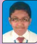
ABBAS 11D - DEC. 11