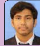
HUSSAIN 12K - DEC. 23