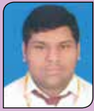
T.G.K. NOYEL 10F - DEC. 29