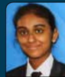
GLORIA - 11H