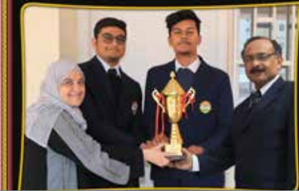
SECOND - 12F