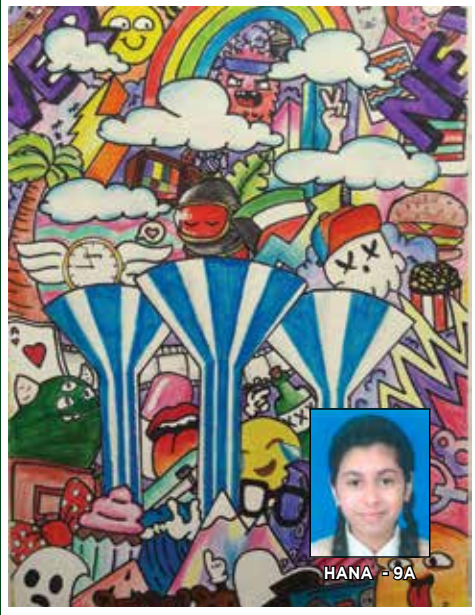
HANA - 9A